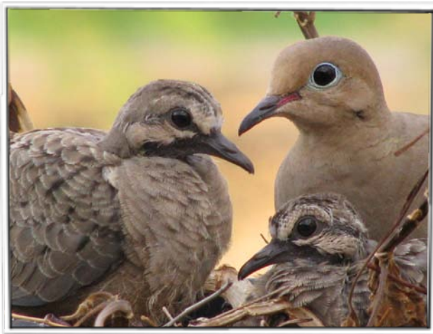
Parent and two chicks

We watched the two babies grow on top of our green umbrella, flutter their wings and eventually depart, first to the garden wall, back to the umbrella top for another day and then they were gone.