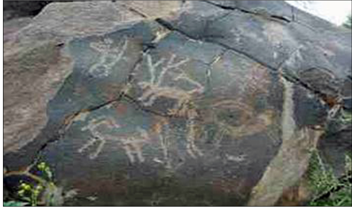
petroglyph in Seven Springs area

on petroglyphs! Then, down below are rock alignment remains (trashed by cattle) and glory be! the beginnings of a metate and lots of potsherds! The wildest artifact is a huge smashed '60s boom box, its inner circuits and buttons fully exposed. One has to speculate who did it and why there? Mysterious circumstances!”