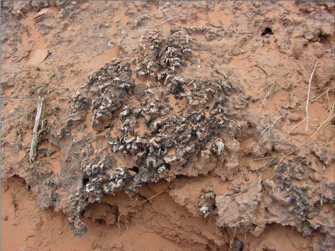
This is Cryptobiotic soil (aka Cryptobiotic Crust, Biological Soil). This picture was taken in Arches National Park by Jeffrey McGrath. [Public Domain]

What is small, almost invisible, and if you step on it, won't recover for 250 years? What?! Cryptobiotic crust wasn't right on the tip of your tongue?