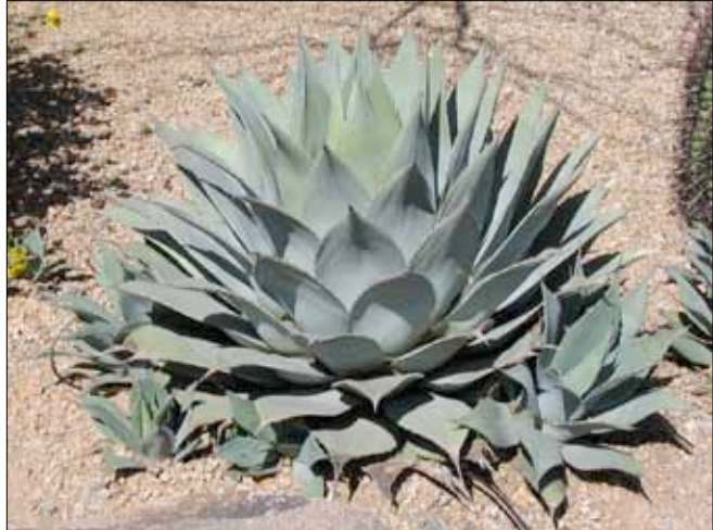
Pups on this Parry Agave surround the mother plant and share identical genetic material